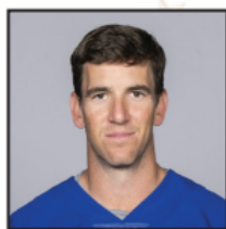
Eli Manning Legendary Quarterback New York Giants