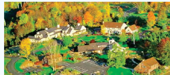
Franciscan Life Center